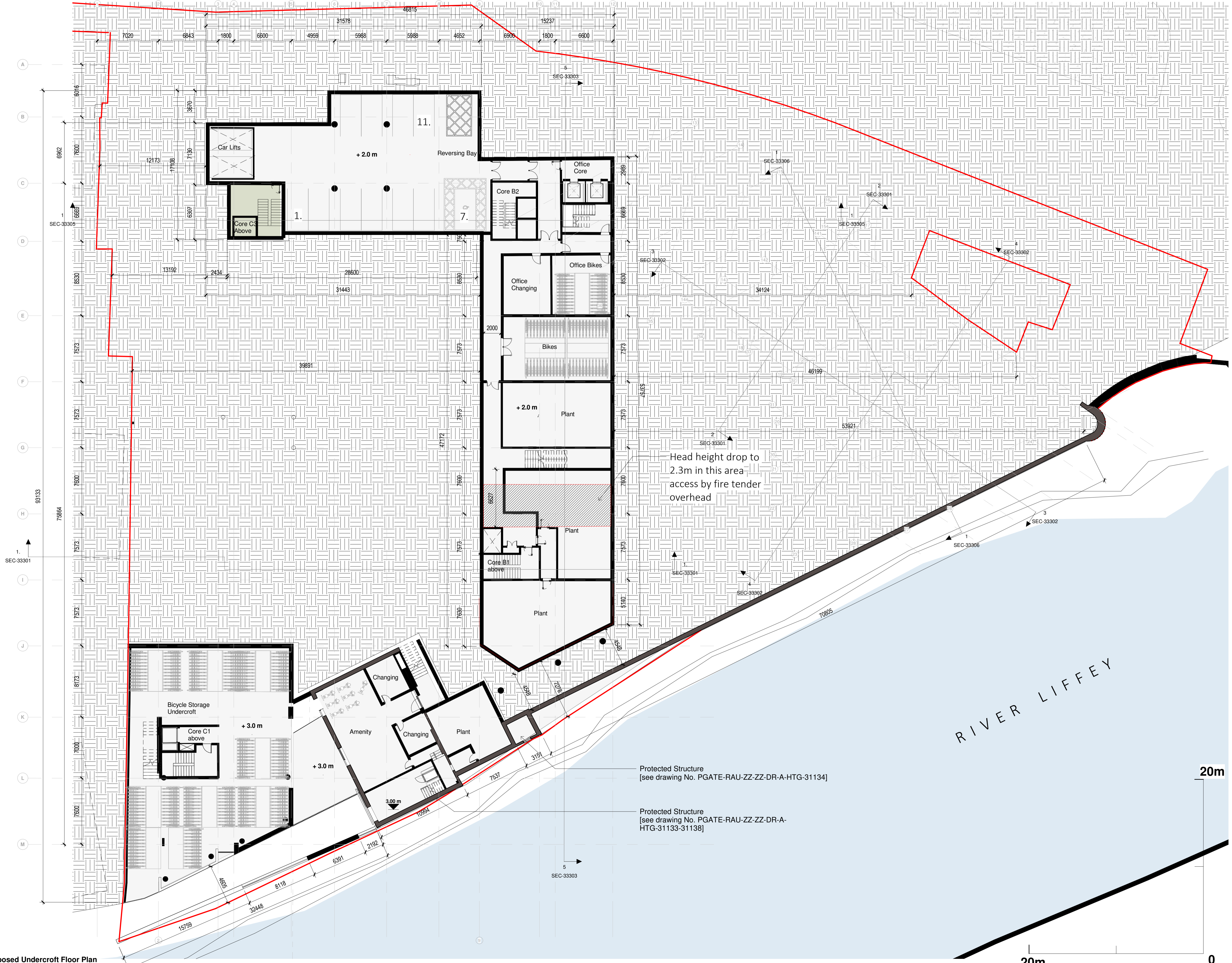
Proposed Undercroft Floor Plan 1 : 200

Notes: DO NOT SCALE FROM THIS DRAWING. USE FIGURED DIMENSIONS IN ALL CASES. VERIFY DIMENSIONS ON SITE AND REPORT ANY DISCREPANCIES TO THE ARCHITECTS IMMEDIATELY. THIS DRAWING TO BE READ IN CONJUNCTION WITH THE ARCHITECTS SPECIFICATION. © THIS DRAWING IS COPYRIGHT AND MAY ONLY BE REPRODUCED WITH THE ARCHITECTS PERMISSION. OSI License Number - AR 0052219 Projection / Spatial Reference: Projection: IRENE1968 Irish Transverse Mercator Centre Point Coordinates: X,Y: 713657.3699 734403.2446 Reference Index: Map Series / Map Sheets 1:1,000 3263-02 1:1,000 3263-06 1:1,000 3263-07 1:1,000 3263-03 Vertical Datum: MALIN HEAD